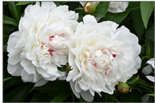
Festiva Maxima Peony flowers

Festiva Maxima Peony is recommended for the following landscape applications;