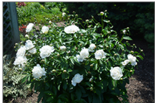
Festiva Maxima Peony in bloom

North Hanley 4215 North Hanley Road St. Louis, MO 63121 (314) 428.9878