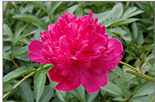
Felix Crousse Peony flowers

North Hanley 4215 North Hanley Road St. Louis, MO 63121 (314) 428.9878