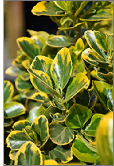
Gold Variegated Japanese Euonymus foliage

Gold Variegated Japanese Euonymus is recommended for the following landscape applications;