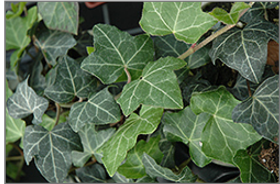
Baltic Ivy foliage