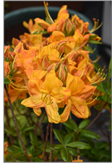
Klondyke Azalea flowers