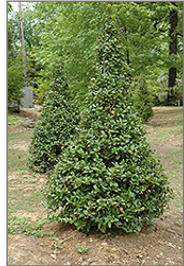
Castle Spire Meserve Holly