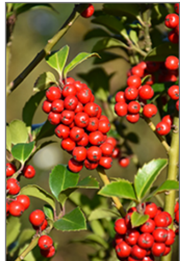
Castle Spire Meserve Holly fruit

North Hanley 4215 North Hanley Road St. Louis, MO 63121 (314) 428.9878