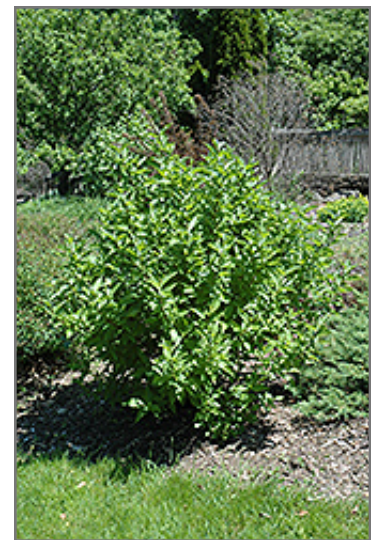
Arctic Fire Red Twig Dogwood

North Hanley 4215 North Hanley Road St. Louis, MO 63121 (314) 428.9878