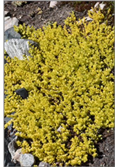
Goldilocks Creeping Jenny

Goldilocks Creeping Jenny will grow to be only 6 inches tall at maturity, with a spread of 3 feet. When grown in masses or used as a bedding plant, individual plants should be spaced approximately 24 inches apart. Its foliage tends to remain low and dense right to the ground. It grows at a fast rate, and under ideal conditions can be expected to live for approximately 10 years. As an herbaceous perennial, this plant will usually die back to the crown each winter, and will regrow from the base each spring. Be careful not to disturb the crown in late winter when it may not be readily seen!