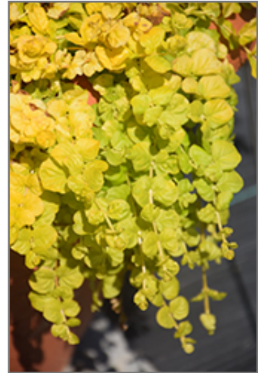
Goldilocks Creeping Jenny foliage