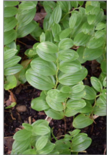
Solomon's Seal foliage

Solomon's Seal is recommended for the following landscape applications;