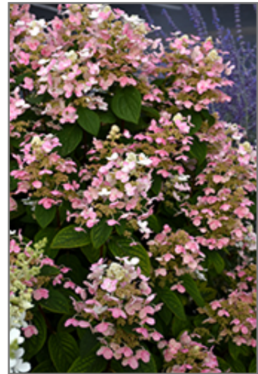
Quick Fire Hydrangea flowers