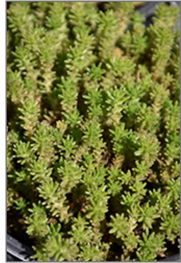
Six Row Stonecrop foliage

Six Row Stonecrop is a fine choice for the garden, but it is also a good selection for planting in outdoor pots and containers. Because of its spreading habit of growth, it is ideally suited for use as a 'spiller' in the 'spiller-thriller-filler' container combination; plant it near the edges where it can spill gracefully over the pot. Note that when growing plants in outdoor containers and baskets, they may require more frequent waterings than they would in the yard or garden.