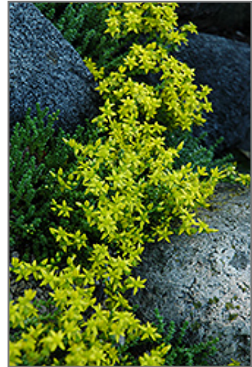
Six Row Stonecrop flowers