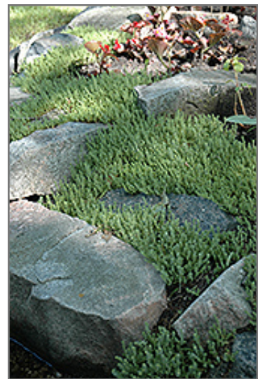
Six Row Stonecrop