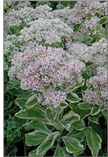
Frosty Morn Stonecrop flowers