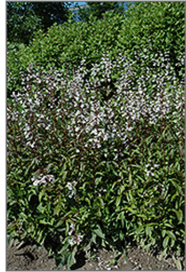
Husker Red Beard Tongue in bloom

Husker Red Beard Tongue is a fine choice for the garden, but it is also a good selection for planting in outdoor pots and containers. With its upright habit of growth, it is best suited for use as a 'thriller' in the 'spiller-thriller-filler' container combination; plant it near the center of the pot, surrounded by smaller plants and those that spill over the edges. Note that when growing plants in outdoor containers and baskets, they may require more frequent waterings than they would in the yard or garden.