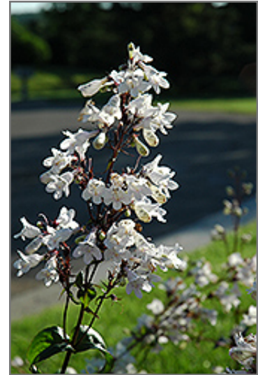
Husker Red Beard Tongue flowers