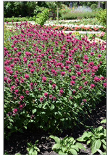
Raspberry Wine Beebalm in bloom

North Hanley 4215 North Hanley Road St. Louis, MO 63121 (314) 428.9878