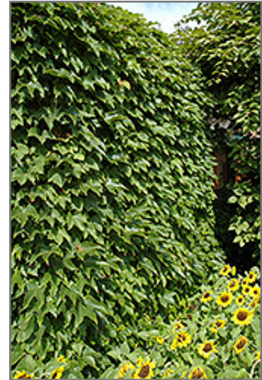
Boston Ivy

This woody vine does best in full sun to partial shade. It is very adaptable to both dry and moist locations, and should do just fine under average home landscape conditions. It is considered to be drought-tolerant, and thus makes an ideal choice for xeriscaping or the moisture-conserving landscape. It is not particular as to soil type or pH, and is able to handle environmental salt. It is highly tolerant of urban pollution and will even thrive in inner city environments. This species is not originally from North America.