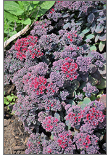
Rock 'N Grow Superstar Stonecrop flower buds

Rock 'N Grow Superstar Stonecrop is a dense herbaceous perennial with a mounded form. Its medium texture blends into the garden, but can always be balanced by a couple of finer or coarser plants for an effective composition.