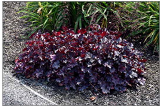
Plum Pudding Coral Bells

Plum Pudding Coral Bells is a fine choice for the garden, but it is also a good selection for planting in outdoor pots and containers. It is often used as a 'filler' in the 'spiller-thriller-filler' container combination, providing a mass of flowers and foliage against which the larger thriller plants stand out. Note that when growing plants in outdoor containers and baskets, they may require more frequent waterings than they would in the yard or garden.