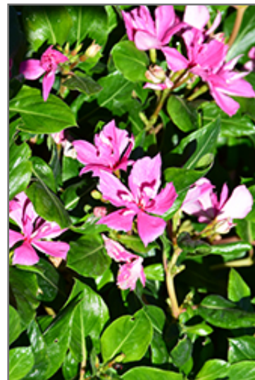
Soiree Kawaii Double Pink Vinca flowers

Soiree Kawaii Double Pink Vinca is recommended for the following landscape applications;