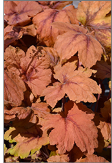
Pumpkin Spice Foamy Bells foliage

Pumpkin Spice Foamy Bells is recommended for the following landscape applications;