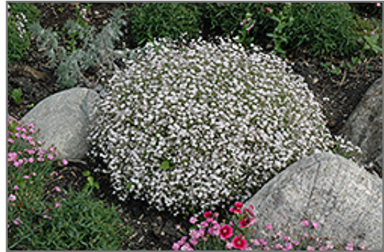
Creeping Baby's Breath in bloom