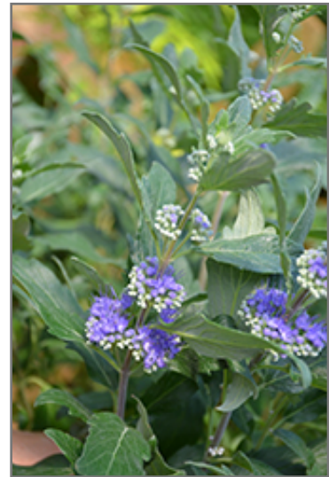
Beyond Midnight Caryopteris flowers

Beyond Midnight Caryopteris is recommended for the following landscape applications;