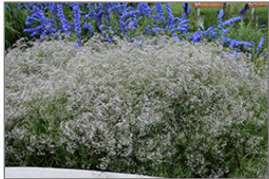
Common Baby's Breath in bloom