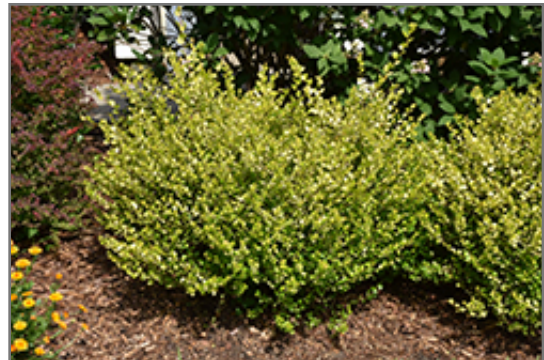
Cesky Gold Dwarf Birch