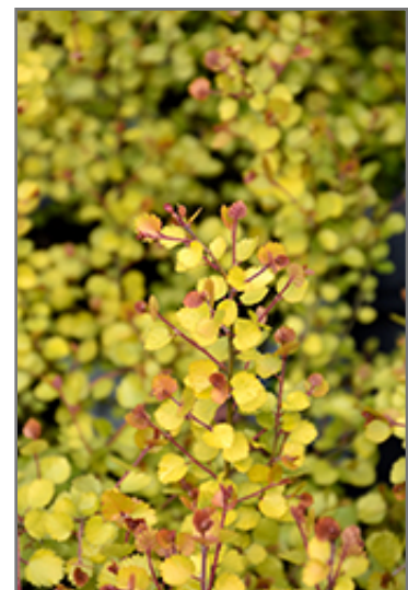
Cesky Gold Dwarf Birch foliage

North Hanley 4215 North Hanley Road St. Louis, MO 63121 (314) 428.9878