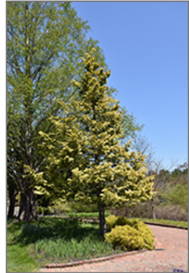
Cripps Gold Falsecypress

* This is a 'special order' plant - contact store for details