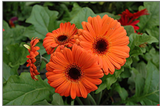
Orange Gerbera Daisy flowers