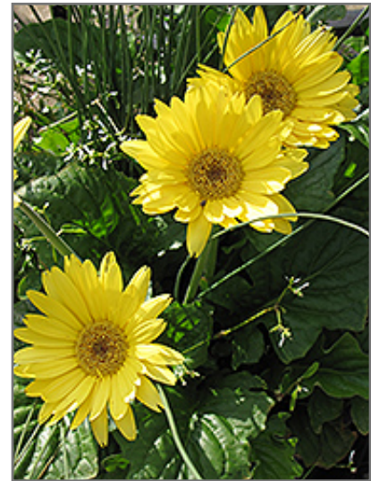
Festival Yellow Gerbera Daisy flowers

When grown indoors, Festival Yellow Gerbera Daisy can be expected to grow to be about 8 inches tall at maturity extending to 12 inches tall with the flowers, with a spread of 8 inches. It grows at a fast rate, and under ideal conditions can be expected to live for approximately 3 years. This houseplant will do well in a location that gets either direct or indirect sunlight, although it will usually require a more brightly-lit environment than what artificial indoor lighting alone can provide. It does best in average to evenly moist soil, but will not tolerate standing water. The surface of the soil shouldn't be allowed to dry out completely, and so you should expect to water this plant once and possibly even twice each week. Be aware that your particular watering schedule may vary depending on its location in the room, the pot size, plant size and other conditions; if in doubt, ask one of our experts in the store for advice. It is not particular as to soil type or pH; an average potting soil should work just fine.