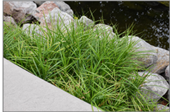
Palm Sedge

Palm Sedge will grow to be about 16 inches tall at maturity, with a spread of 24 inches. Its foliage tends to remain dense right to the ground, not requiring facer plants in front. It grows at a medium rate, and under ideal conditions can be expected to live for approximately 10 years. As an herbaceous perennial, this plant will usually die back to the crown each winter, and will regrow from the base each spring. Be careful not to disturb the crown in late winter when it may not be readily seen!