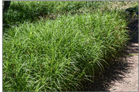
Palm Sedge

Palm Sedge is recommended for the following landscape applications;