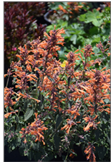
Kudos Mandarin Hyssop flowers