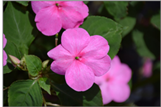
Lollipop Bubblegum Pink Impatiens flowers

Lollipop Bubblegum Pink Impatiens is recommended for the following landscape applications;