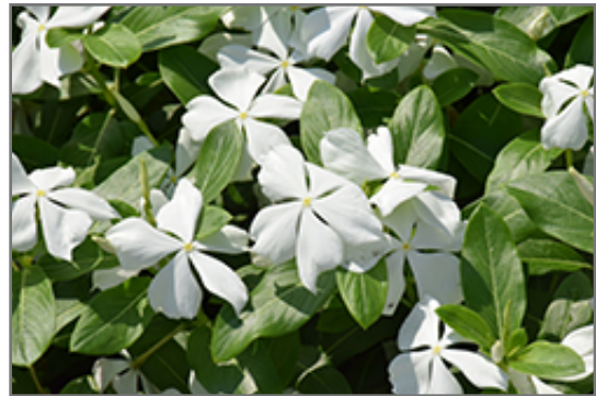
Valiant Pure White Vinca flowers

This plant will require occasional maintenance and upkeep, and should not require much pruning, except when necessary, such as to remove dieback. It is a good choice for attracting butterflies to your yard, but is not particularly attractive to deer who tend to leave it alone in favor of tastier treats. It has no significant negative characteristics.