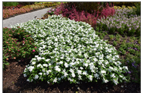
Valiant Pure White Vinca in bloom

North Hanley 4215 North Hanley Road St. Louis, MO 63121 (314) 428.9878