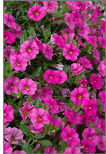
MiniFamous Neo Pink Calibrachoa flowers

MiniFamous Neo Pink Calibrachoa is a dense herbaceous annual with a trailing habit of growth, eventually spilling over the edges of hanging baskets and containers. Its medium texture blends into the garden, but can always be balanced by a couple of finer or coarser plants for an effective composition.