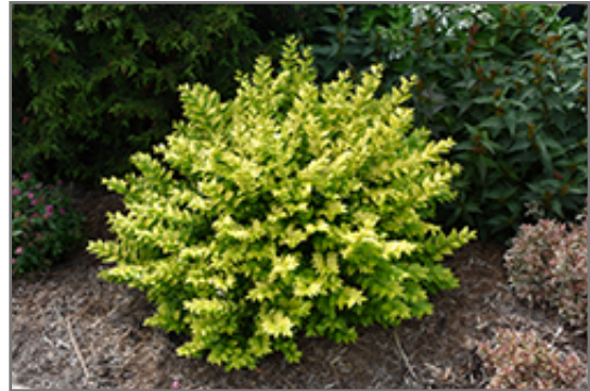
Golden Ticket Privet