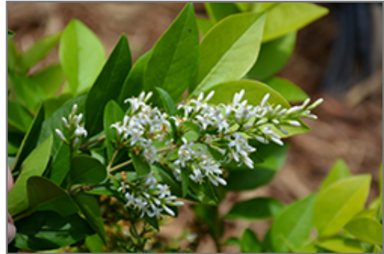
Golden Ticket Privet flowers

This shrub should only be grown in full sunlight. It is very adaptable to both dry and moist locations, and should do just fine under average home landscape conditions. It is not particular as to soil type or pH, and is able to handle environmental salt. It is highly tolerant of urban pollution and will even thrive in inner city environments. This particular variety is an interspecific hybrid.