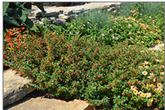
Vermillionaire Large Firecracker Plant in bloom

North Hanley 4215 North Hanley Road St. Louis, MO 63121 (314) 428.9878