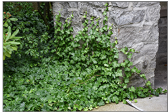
English Ivy

English Ivy will grow to be about 8 inches tall at maturity, with a spread of 20 feet. As a climbing vine, it tends to be leggy near the base and should be underplanted with low-growing facer plants. It should be planted near a fence, trellis or other landscape structure where it can be trained to grow upwards on it, or allowed to trail off a retaining wall or slope. It grows at a fast rate, and under ideal conditions can be expected to live for approximately 30 years.