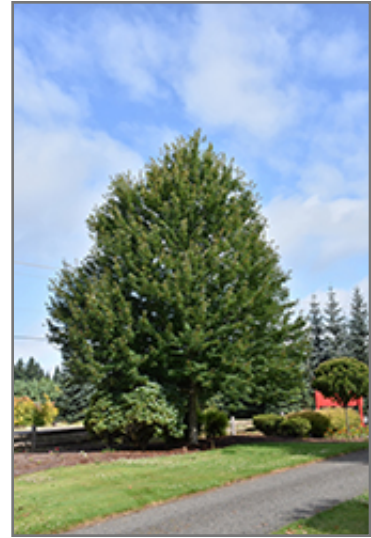
Redpointe Red Maple