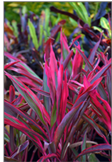
Maria Cordyline foliage

North Hanley 4215 North Hanley Road St. Louis, MO 63121 (314) 428.9878