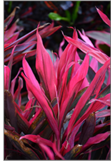
Maria Cordyline foliage

This plant does best in full sun to partial shade. It does best in average to evenly moist conditions, but will not tolerate standing water. It is not particular as to soil type or pH, and is able to handle environmental salt. It is somewhat tolerant of urban pollution. This particular variety is an interspecific hybrid.