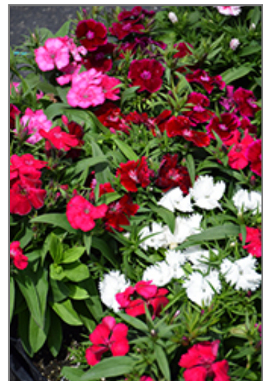
Floral Lace Mix Pinks flowers

North Hanley 4215 North Hanley Road St. Louis, MO 63121 (314) 428.9878