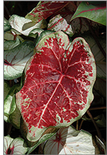
Raspberry Moon Caladium foliage