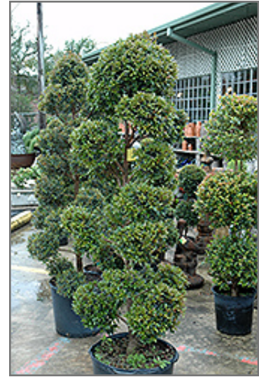
Brush Cherry

Brush Cherry is recommended for the following landscape applications;