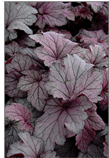
Spellbound Coral Bells foliage

North Hanley 4215 North Hanley Road St. Louis, MO 63121 (314) 428.9878