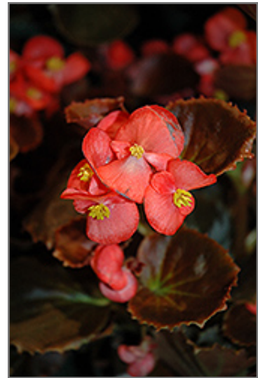
Nightife Red Begonia flowers

This is a high maintenance plant that will require regular care and upkeep, and usually looks its best without pruning, although it will tolerate pruning. Deer don't particularly care for this plant and will usually leave it alone in favor of tastier treats. Gardeners should be aware of the following characteristic(s) that may warrant special consideration;