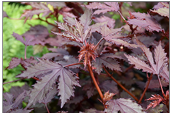
Mahogany Splendor Hibiscus foliage

North Hanley 4215 North Hanley Road St. Louis, MO 63121 (314) 428.9878