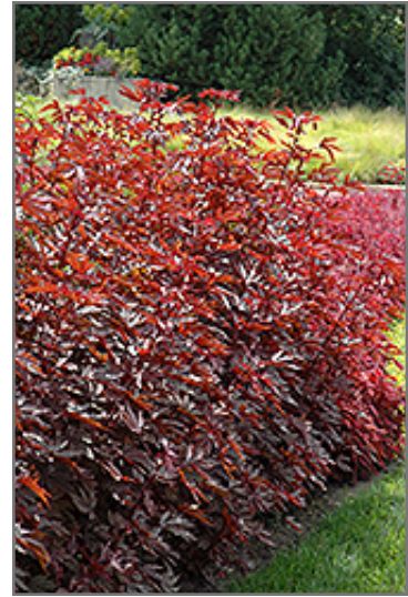
Mahogany Splendor Hibiscus

Mahogany Splendor Hibiscus is recommended for the following landscape applications;