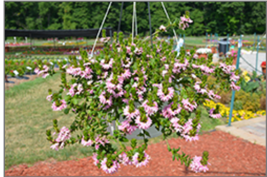
Bombay Pink Fan Flower in bloom

Bombay Pink Fan Flower is a fine choice for the garden, but it is also a good selection for planting in outdoor containers and hanging baskets. Because of its trailing habit of growth, it is ideally suited for use as a 'spiller' in the 'spiller-thriller-filler' container combination; plant it near the edges where it can spill gracefully over the pot. Note that when growing plants in outdoor containers and baskets, they may require more frequent waterings than they would in the yard or garden.