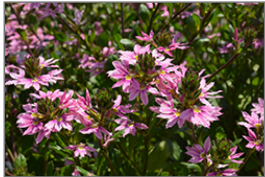
Bombay Pink Fan Flower flowers

Bombay Pink Fan Flower is recommended for the following landscape applications;