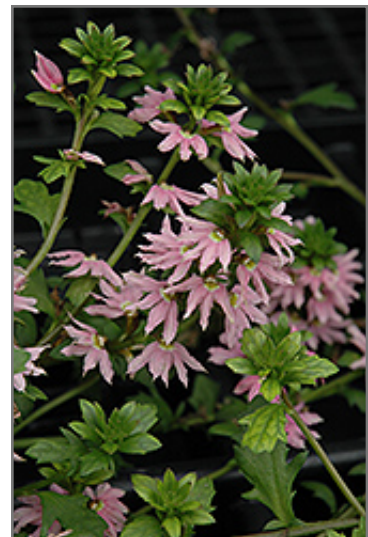
Bombay Pink Fan Flower flowers