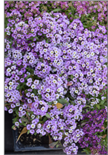
Clear Crystal Lavender Shades Sweet Alyssum flowers

Clear Crystal Lavender Shades Sweet Alyssum is recommended for the following landscape applications;