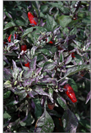
Calico Ornamental Pepper fruit