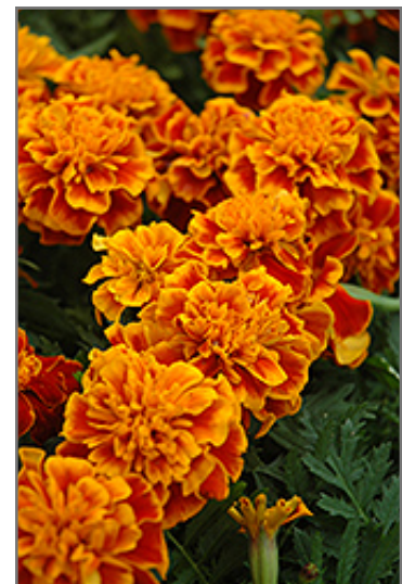
Bonanza Flame Marigold flowers

North Hanley 4215 North Hanley Road St. Louis, MO 63121 (314) 428.9878