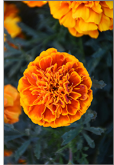
Bonanza Flame Marigold flowers