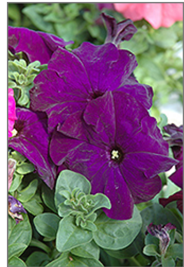
Dreams Midnight Petunia flowers

North Hanley 4215 North Hanley Road St. Louis, MO 63121 (314) 428.9878