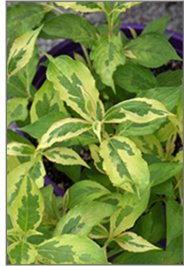
My Monet Sunset Weigela foliage

My Monet Sunset Weigela is recommended for the following landscape applications;