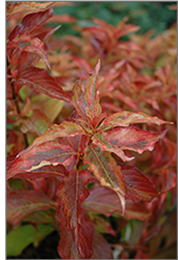
My Monet Sunset Weigela in fall

My Monet Sunset Weigela makes a fine choice for the outdoor landscape, but it is also well-suited for use in outdoor pots and containers. It is often used as a 'filler' in the 'spiller-thriller-filler' container combination, providing a mass of flowers and foliage against which the thriller plants stand out. Note that when grown in a container, it may not perform exactly as indicated on the tag - this is to be expected. Also note that when growing plants in outdoor containers and baskets, they may require more frequent waterings than they would in the yard or garden.