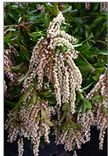
Mountain Fire Japanese Pieris flowers

North Hanley 4215 North Hanley Road St. Louis, MO 63121 (314) 428.9878