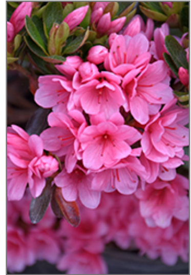
Coral Bells Azalea flowers